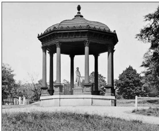
Monument to Henry Clay in the Capitol grounds of Richmond, Va., photographed in 1865. It was removed in 1930

This article appeared in the "Century Co", NY, Vol. XXXIII, December 1886. It is reproduced above with its original formatting, spelling and punctuation.